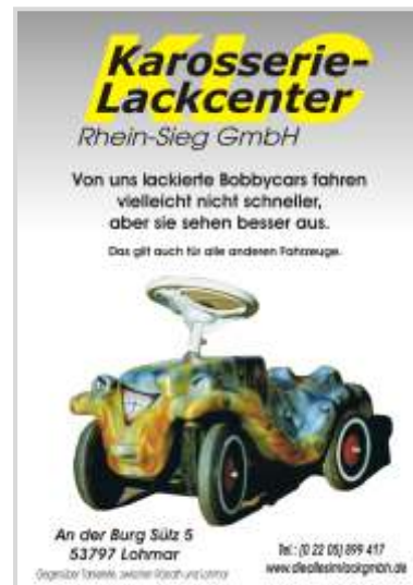
Ad designed using CorelDRAW: this appeared in a booklet for a bobbycar-race