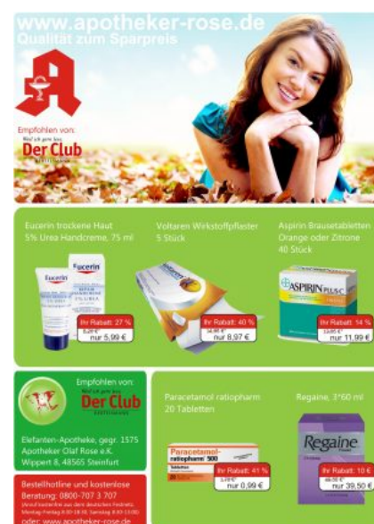
Fall 2009 cover of the mail order pharmacy catalogue

16 pages of product and price information." For this, he masks product shots provided by pharmaceutical companies against a new, colored background. "I publish the final files to PDF and send them to the print shop or advertising agency I work with." But he also created a whole new look for the discount pharmacy Pharmaxi using CorelDRAW and eye-catching colors like lime green and glaring red for store spaces, stationery and