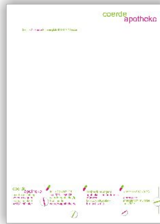
Stationery with new corporate identity of Coerde pharmacy in Münster

"Never change a winning team, as the saying goes!"