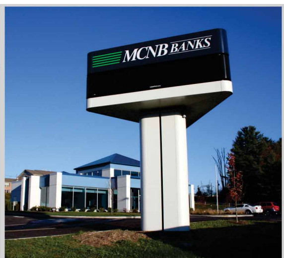
CorelDRAW helps Identity America’s designers create architectural, schematic drawings that they can reuse throughout a project — from the design phase through physical implementation.