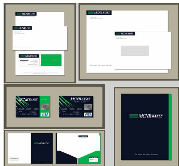
A collection of professional designs provided to MCNB Banks by Identity America includes, letterhead, brochures, business cards, envelopes, banking and credit cards, and much more.