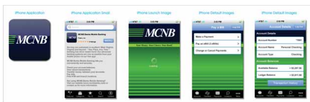
MCNB Banks new iPhone and mobile banking apps were designed by Identity America.