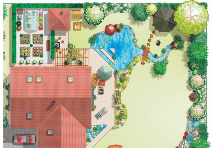
Fig. 1: Projection view of a garden design created in CorelDRAW

Another requirement was that his tool would need to let him easily create and manage a database of commonly used objects,