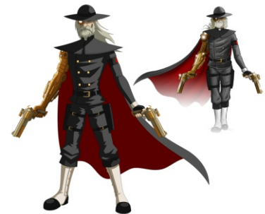
Vector shaping tools let you create with confidence.