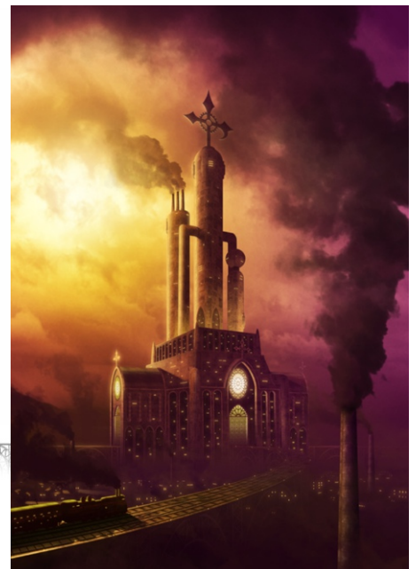
Every project begins with a sketch before the creative transformation in CorelDRAW Graphics Suite begins.