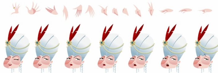
Create highly detailed line art with the precision of the Bézier and other tools.