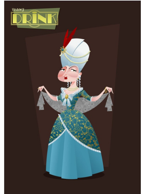
The History Channel's History Drink series involved a number of true-to-life characters, each designed using CorelDRAW.