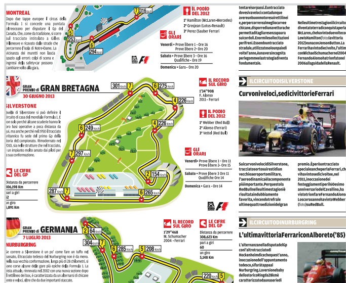
CorelDRAW Graphics Suite makes adding text and cropping images as easy and intuitive as creating a collage.

"The first CorelDRAW application I used in the late 80s was version 4. Since then, I haven't stopped using CorelDRAW — the latest version, of course — especially when working on advertising." The advantages are obvious: CorelDRAW allows the creation of graphics of all kinds, with the greatest speed and millimetric precision. "Having learned the old systems, it